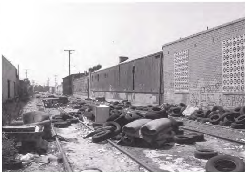
Trash, tires, and debris now litter what were once active railroad tracks carrying commerce in and out of South Central Los Angeles.