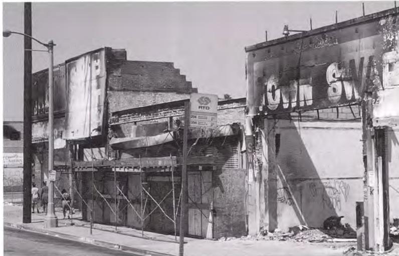
Many businesses were destroyed during the civil disturbances in April and May of 1992.