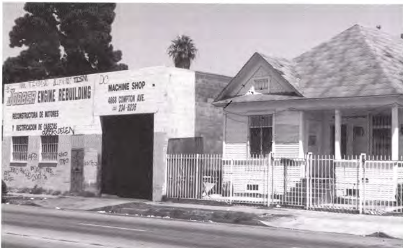
Parts of South Central Los Angeles are characterized by inappropriate adjacent land uses.

The CDC should not limit itself to capital expansion from the group of founding banks. It can and should be structured to receive equity capital, as well as loans from other national banks, state banks, savings institutions, insurance companies, pension funds, corporations, foundations, and many other entities, including individual investors. This could be arranged legally and should be encouraged, as such an arrangement would allow the CDC to grow by drawing from a wide base of capital support.