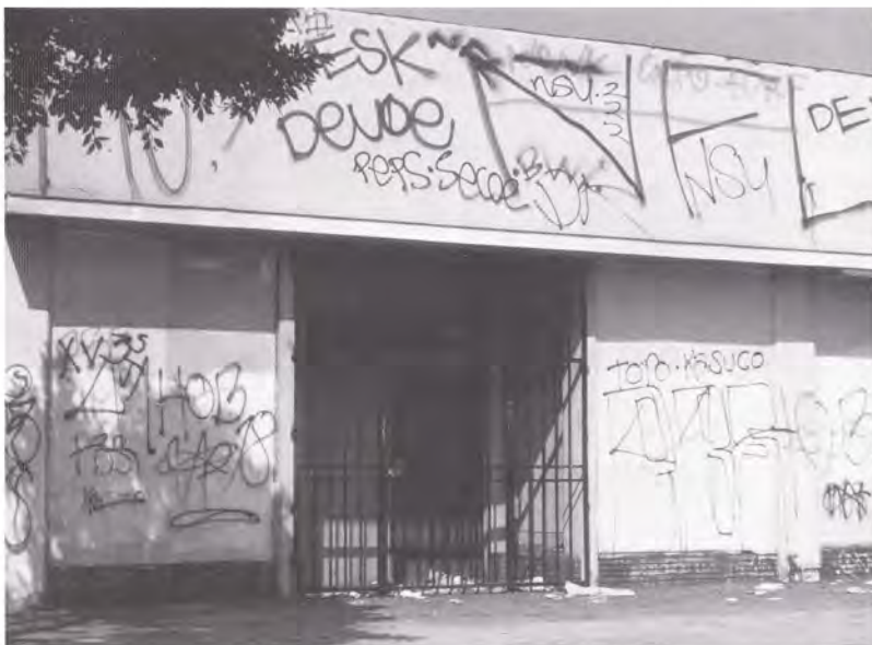
Widespread graffiti mark gang territory.

The multibank CDC should be structured as a profit-oriented, long-term entity that serves low- and moderate-income communities. Its initial focus should be selected neighborhoods within South Central Los Angeles.