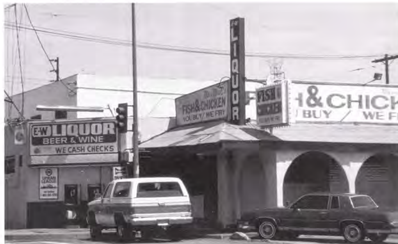
Liquor stores, which also serve as convenience stores and check-cashing facilities, are a common sight in South Central Los Angeles.